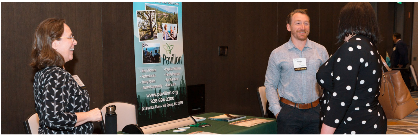
EXHIBIT AT THE FSPHP 2026 ANNUAL EDUCATION CONFERENCE