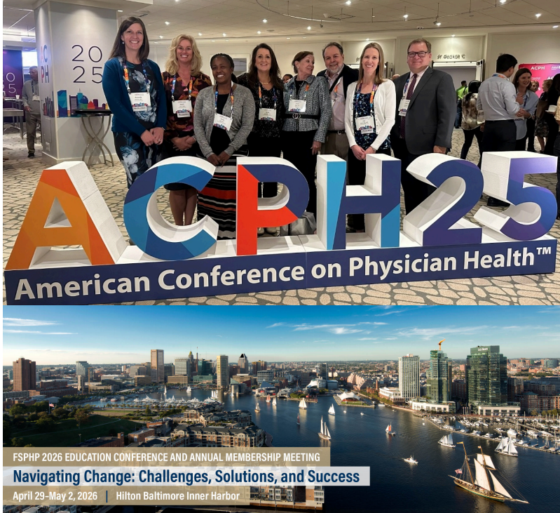
Exhibit at FSPHP 2026 in Baltimore!

Join us April 29–May 2, 2026, for the FSPHP Education Conference and Annual Membership Meeting: Navigating Change—Challenges, Solutions, and Success . This premier event brings together 300+ physicians, healthcare professionals, and PHP experts dedicated to clinician health and well-being.