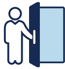
Increasing Access to Services

A robust suicide prevention program should incorporate interventions that address all three drivers. The interventions are categorized into four types, according to their area of focus: