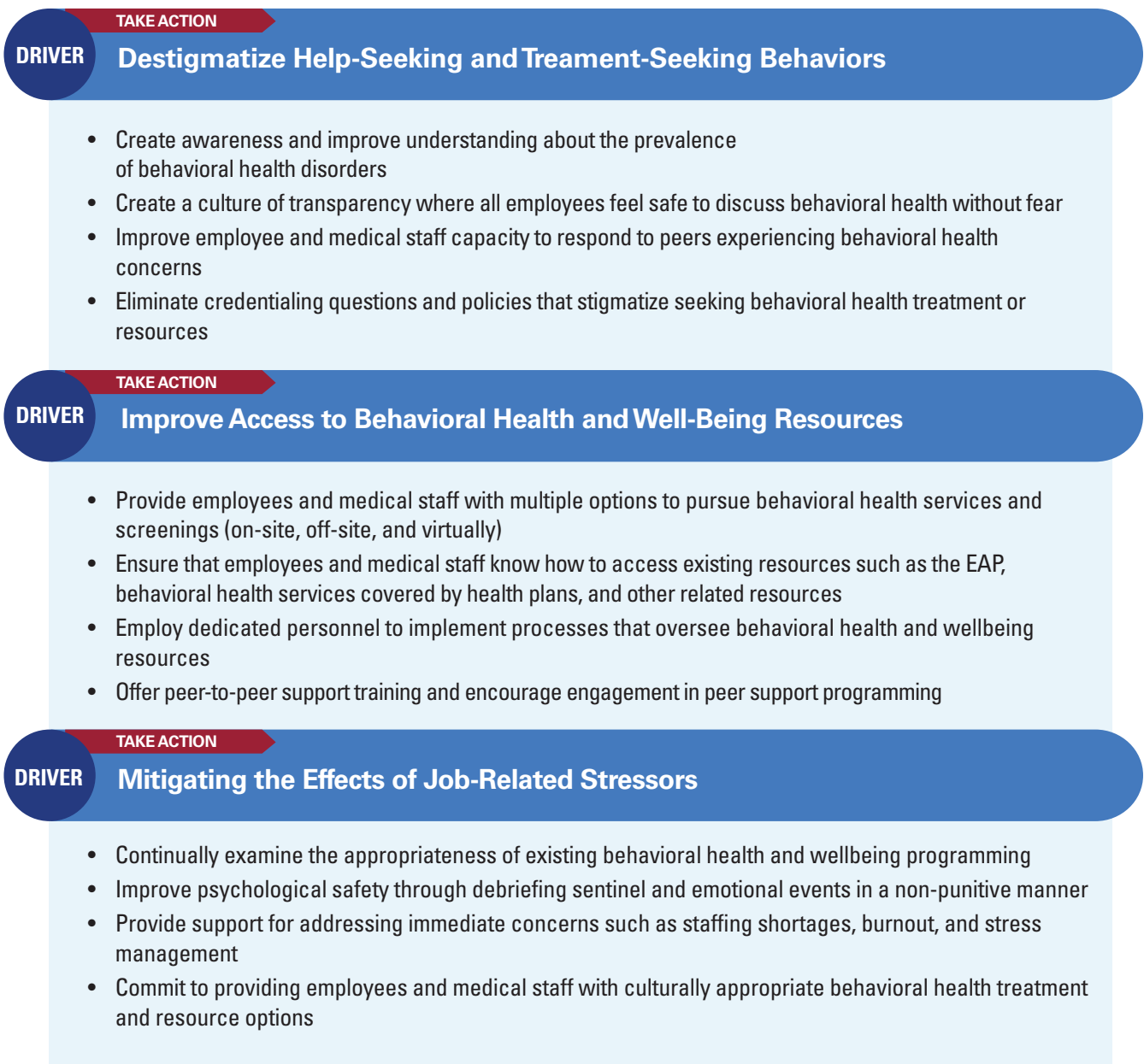
Figure 2. Addressing the Drivers of Suicide in the Health Care Workforce

While the literature review did not reveal any one specific intervention with strong evidence of preventing suicide among health care professionals, several interventions identified in the literature, survey data, and interview and focus group data demonstrated some indication of effectiveness and a broad uptake among hospitals and health care systems. As the research community devotes more attention to this issue, hospitals and health care systems can introduce resources and support as a foundation for building evidence-based approaches and ensure that adequate, high-quality behavioral health and well-being and suicide prevention resources are offered.