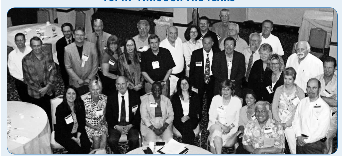
Past FSPHP Annual Business Meeting