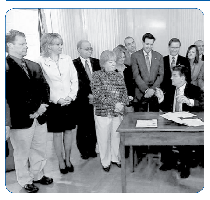
WV Governor Joe Manchin signing the legislation allowing for the formation of the WVMPHP in 2007